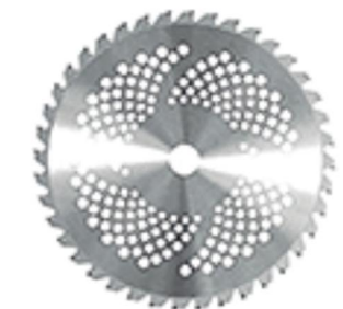
40 TEETH BLADE